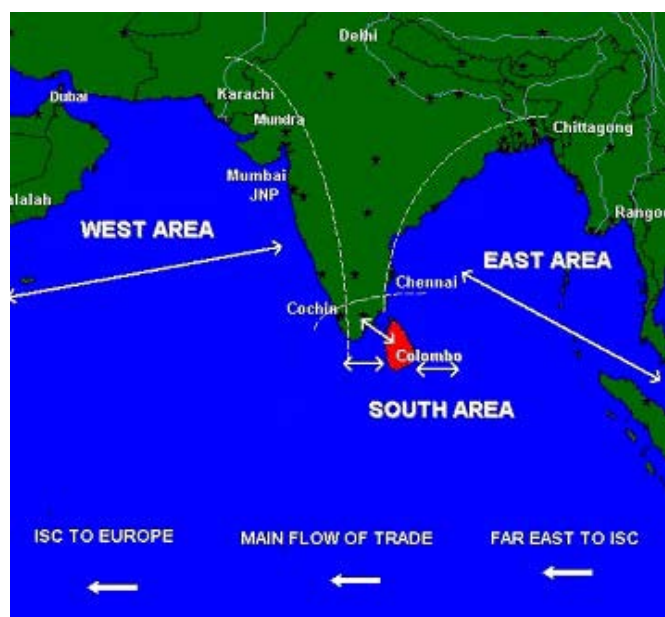
Strategic location of transshipment ports

Similar developments are emerging on the east coast of the Indian Sub-Continent with more direct calls. However, the diversion required for large ships is significantly greater than for the west coast and the traffic volumes are smaller; so this development will take longer to reach a point at which direct calls are justified. All in all, transshipment is a risky business for the ports. It should be realised that this traffic is very foot-loose and competitive. Rates are low and only when high volumes are achieved jointly with a substantial own cargo base, success is possible. Moreover, transshipment rates should not be regulated in view of the international competition in this field.