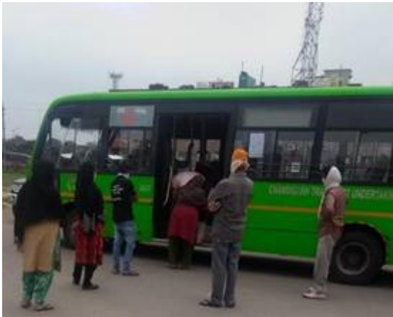
F&Von Bus delivered to Citizens

Municipal Corporation in collaboration with Chandigarh Transport Undertaking also started delivering fruits and vegetables at neighbourhood level on regular basis. The service is available to all 12 lakh citizens and is being utilized across the city by over one and half lakh households.