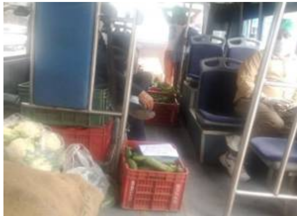
F&Von Bus delivered to Citizens