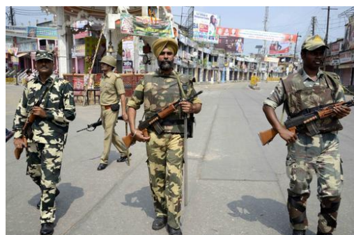
Muzaffarnagar, 2013.

Obviously, the existence of the camps had become a major source of media attraction and consistent criticism of the government. The unfortunate fact is that the relief camps were closed down not because the U.P. government was able to restore normalcy, allowing victims to feel safe enough to return to their villages or towns; but because it wanted a closure of the subject as it was finding it difficult to handle criticism relating to poor conditions in the camps. In short, the camps were shut down because they had become inconvenient and embarrassing to the government rather than because the government was able to provide alternative spaces for victims to recover and rebuild their lives.