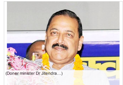
(Doner minister Dr Jitendra...)

The ministry held discussion with several MPs who have worked in security forces and other security experts who have served in the Northeast to generate security inputs which Doner ministry will pass on to the Home Ministry.