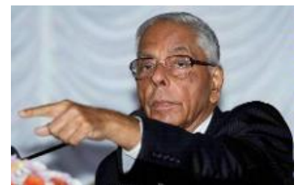
Former national security advisor and former governor of West Bengal M K Narayanan

CHENNAI: A seminar in Chennai on Sri Lankan refugees in India turned ugly with a protestor flinging a footwear at former national security adviser M K Narayanan on Wednesday evening. Narayanan was coming down the dais after his speech when he was hit by the footwear on the back.