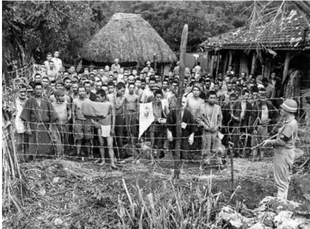
A Marine guards Japanese prisoners of war after the Battle of Okinawa. More than 148,000 civilians died in the campaign.

There are people who were driven by the perverse idea that, rather than seeing female siblings and wives being killed cruelly and outraged by brute Americans and Brits, it was an act of love by close relatives to kill them with their own hands.