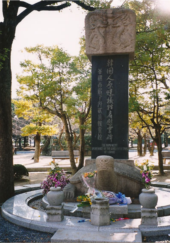
Memorial for the Korean victims of atomic bombing in Hiroshima