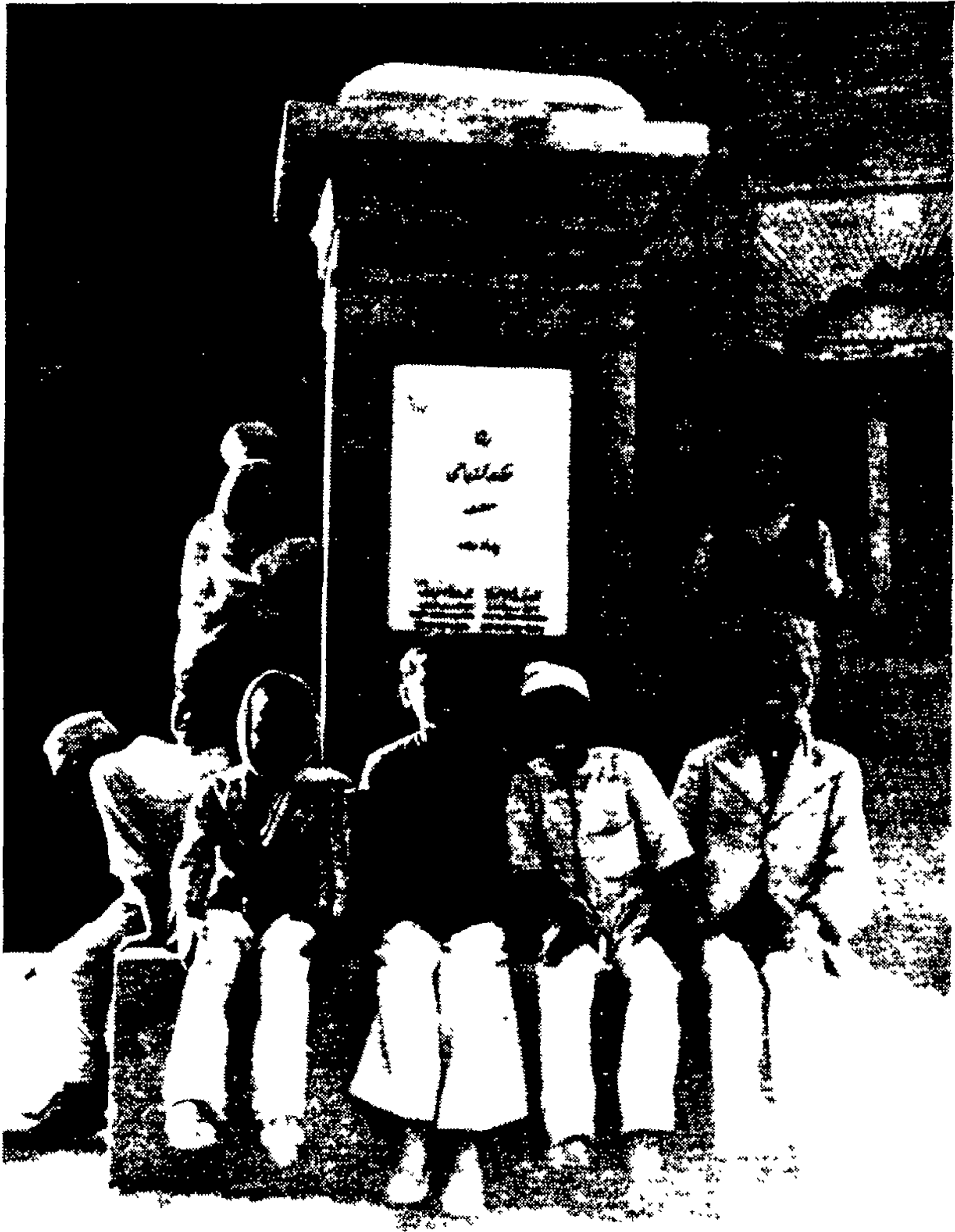
J AISI MEMORIAL