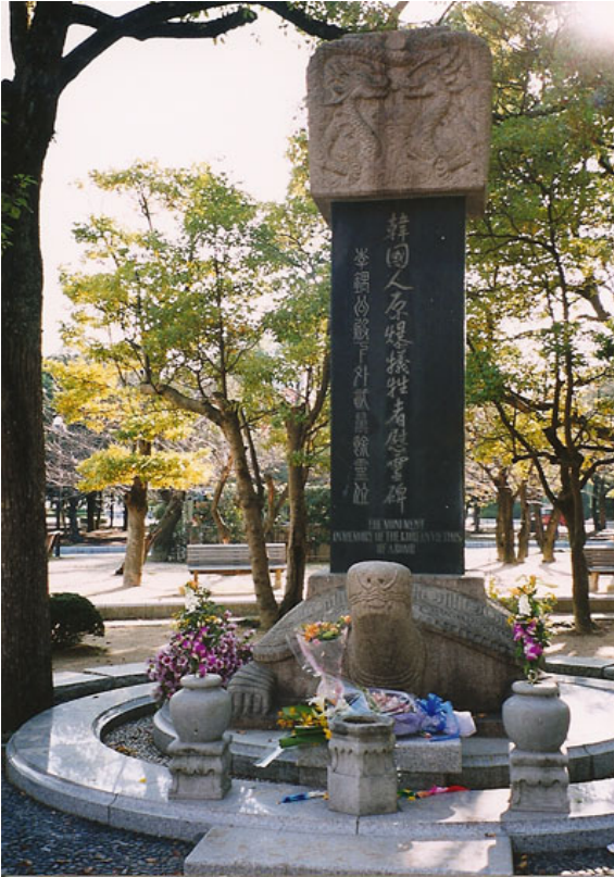
Memorial for the Korean victims of atomic bombing in Hiroshima